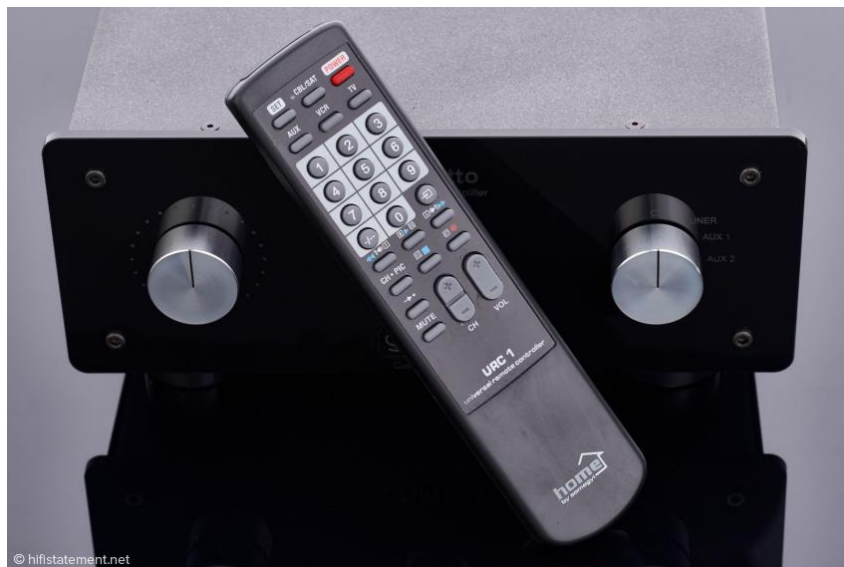
The enclosed universal remote control can only regulate the volume. For a sufficient and inexpensive solution - it does not always have to be nutwood

The Menuetto Custom for 1700 Euro is the middle amplifier between the previously mentioned ecstasy and the smaller knuffeligen ampino. Somewhat confusing are the internationally and in Germany offered versions. To ensure CE conformity, other speaker connections had to be installed. They chose the very good (and expensive) WBT-0703-Cu-nextgen™ pole terminals. Wherever you went, there are two pairs of WBT-0210 Cu-nextgen™ cinch sockets. And to make the whole thing round, there is Mundorf MCaps Supreme SilverGold in the entry level. Thus, the Menuetto is the custom version and more expensive than its normal counterpart, which is not available in Germany. The operation of only 230 wide and 105 millimeters high, but 350 millimeters deep box is no mystery. On the rounded black acrylic glass front, the four high-level inputs and the volume can be selected. The centrally placed power switch disconnects the device hard from the mains. If there were still a phono entry, one would locate the Menuetto in Britain in the late 80s. However, there were rarely glass fronts.