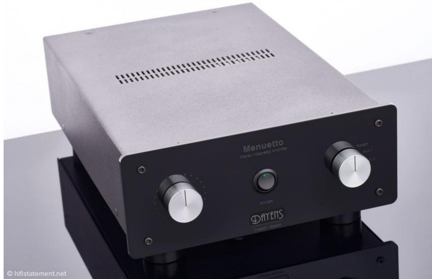
Very reduced appearance or just the restriction to the essentials. The operation of the Dayens Menuetto is self-explanatory